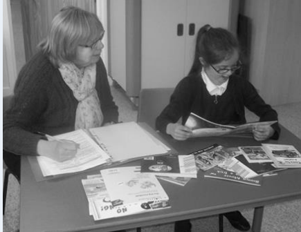
Successful Reading Programme

A lot of children receive extra help in school; this does not necessarily mean that they have Special Educational Needs. We frequently target children to help them catch up and to give extra help so that they do not struggle. We gather data and analyse it. Every pupil is discussed termly to ensure that we as a school are doing all we can to help them make progress. Our school strives to provide a high quality and effective support to enable children to make good progress and succeed.